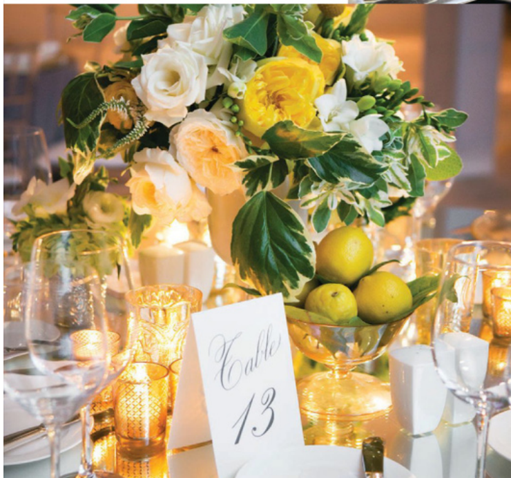
Clockwise from top left: Tall vases of blooming branches allowed conversation to flow freely at tables; the bride’s bouquet featured yellow and white garden roses, ranunculus and lilies of the valley; Tony Conway’s talented team scattered bowls of fresh lemons, glittering candles and vases of garden roses on mirrored-top tables; The St. Regis butlers pass Champagne pre-ceremony; individual wedding cakes designed by Sylvia Weinstock were flown in from New York. Opposite: The newlyweds enjoy their first moments as husband and wife.