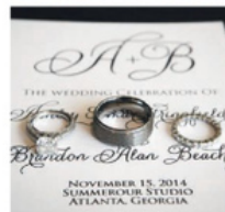
IN FULL BLOOM From above: Bridesmaids wore gowns by twobirds Bridesmaid from Bella Bridesmaids; rings from Miriam's Jewelry and OALO.

After a swift exit through a tunnel of sparklers held by their guests, the happy couple made their way off into the night in a red 1957 Chevy Bel Air convertible and on to a honeymoon at the Viceroy Sugar Beach in St. Lucia.